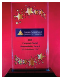
Asian American Chamber of Commerce Corporate Social Responsibility 2020