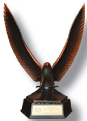
U.S. Department of the Treasury Small Business Prime Contractor 2016